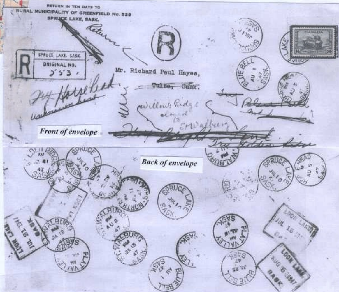
Front of envelope